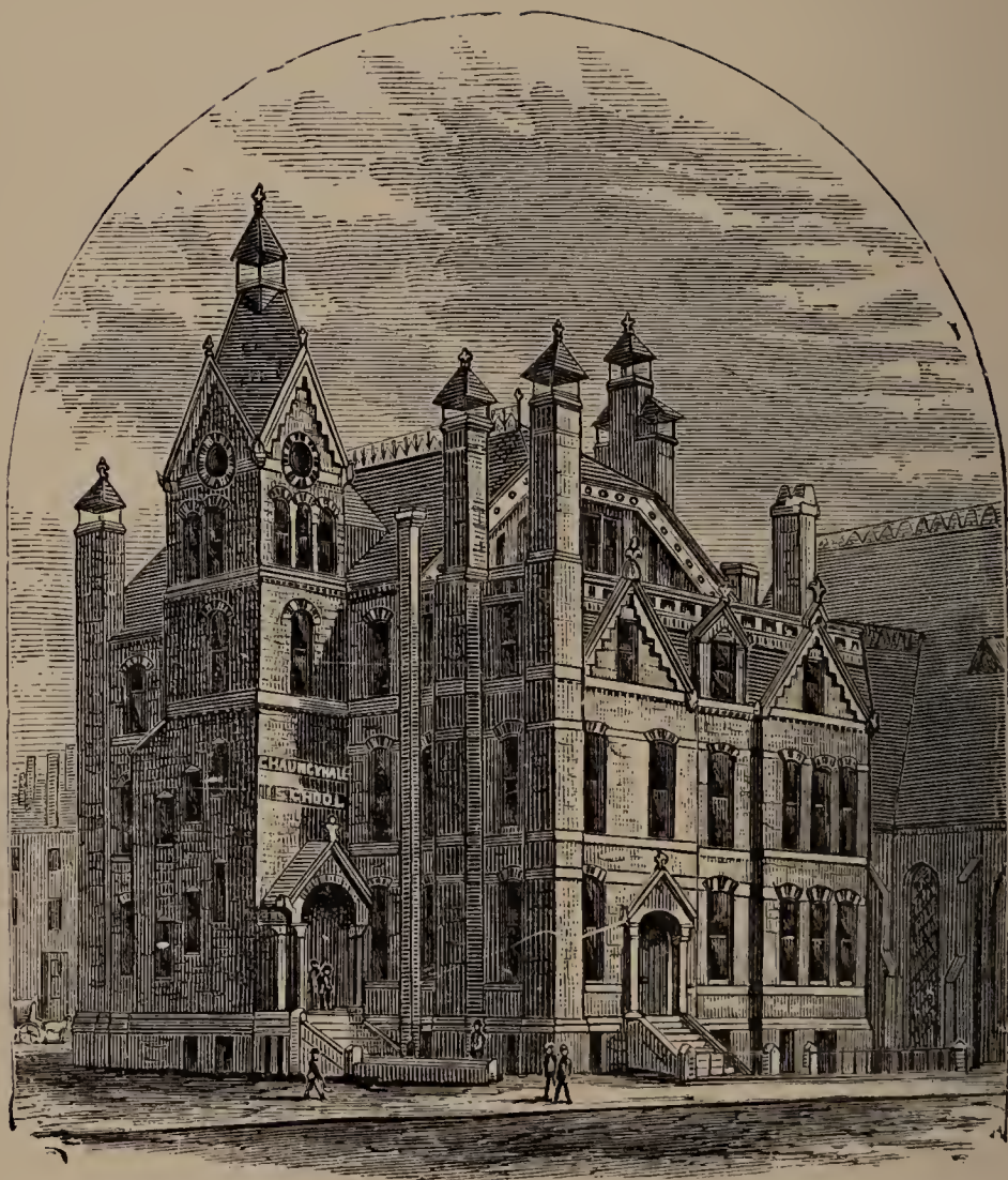
CHAUNCY-HALL SCHOOL HOUSE, 259, Boylston Street, Boston (Opposite the Art Museum).